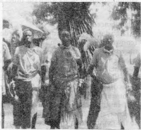
III. 6 Men's costume