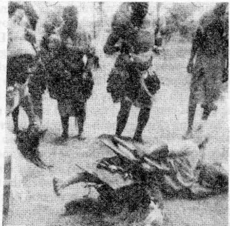
Ill. 8 Kiriba technique, prone