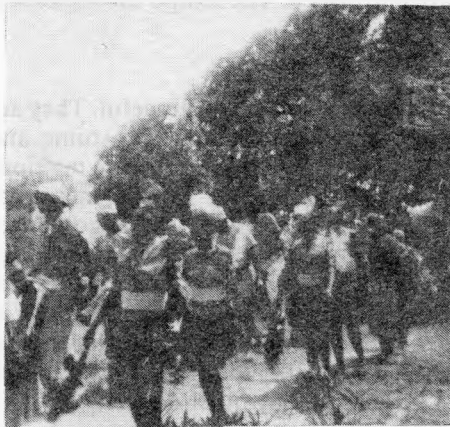
III. 5 Digo mzungano dance, entrance

The characteristic Digo movement is shoulder-shaking, especially by the women. This, although quick, has a light, sensitive quality unlike the more common, vigorous shoulder-shaking of other Kenyan dances, such as those of the Kamba. One shoulder moves forward as the other moves backward in quite quick succession. This is enhanced by small shoulder capes edged with beaded fringes, worn by the women over ordinary knee-length dresses or floor-length wrappers (see Illustration Nos. 4 & 5). The men wear wrappers and tunic shirts of the same cloth as the women, with large feathers attached to their backs diagonally across one shoulder (see Illustration No. 6) again emphasising and enlarging the effect of the shoulder-shaking. Rattles and bells are also worn on ankles or knees by some. The women make themselves even more attractive by wearing plenty of jewellery and ornaments. The dancers tend to be drawn from the older generation and there are approximately equal numbers of men and women. Groups usually have between twelve and twenty dancers.