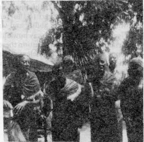
III. 4 Digo kayamba dance, Waa location, Kwale district, women's costume

The characteristic Digo movement is shoulder-shaking, especially by the women. This, although quick, has a light, sensitive quality unlike the more common, vigorous shoulder-shaking of other Kenyan dances, such as those of the Kamba. One shoulder moves forward as the other moves backward in quite quick succession. This is enhanced by small shoulder capes edged with beaded fringes, worn by the women over ordinary knee-length dresses or floor-length wrappers (see Illustration Nos. 4 & 5). The men wear wrappers and tunic shirts of the same cloth as the women, with large feathers attached to their backs diagonally across one shoulder (see Illustration No. 6) again emphasising and enlarging the effect of the shoulder-shaking. Rattles and bells are also worn on ankles or knees by some. The women make themselves even more attractive by wearing plenty of jewellery and ornaments. The dancers tend to be drawn from the older generation and there are approximately equal numbers of men and women. Groups usually have between twelve and twenty dancers.