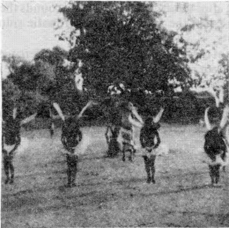
III. 3 Giriama gonda dance, vertical jumps