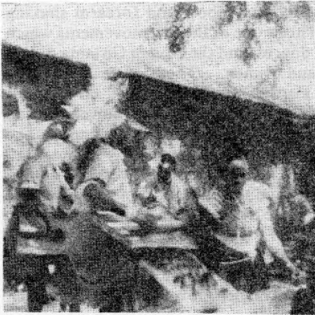
Ill. 7 Digo mzumbano dance, kiriba playing technique

Sengenya is typical of most Digo dances, exhibiting smooth, graceful qualities. Mzumbano , however, is an exception. The outstanding feature of this dance is the kiriba worn and played by the men. The kiriba is a skin with metal imitation cowrie shells attached to it. It is worn on the right leg attached by rope at the waist, the knee and the calf. It stretches from the waist down the outside of the leg almost to the ankle (see Illustrations Nos. 6 & 7). It is played by rubbing a mugao , or metal shield with a wooden handle, up and down the skin, making a very loud sound. In order to do this, the leg must be lifted slightly from the hip, and the body tilted to the left, lifting the kiriba (see Illustration No. 7). It is played whilst the men leap around each other, twisting and turning in the air, and whilst they lie on their sides on the ground (see Illustration No. 8). Whilst this is going on, the women maintain the more typical style