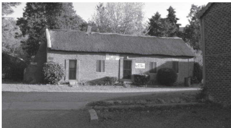
Figure 2. Maeder House, Morija. Photo by C. Lucia, 2006.

Morija in the nineteenth century was a typical mission station, with its church, training institute, bible school, bookshop-cum-publisher (Morija Sesuto Book Depot), post office, and printing press (Morija Printing Works). 4 The oldest building in the village – indeed in Lesotho – is Maeder House (1843; see Gill 1995: 10), which for the last four decades of the nineteenth century housed the printing press. It gives an idea of what part of the village still looks like today. (See Figure 2.)