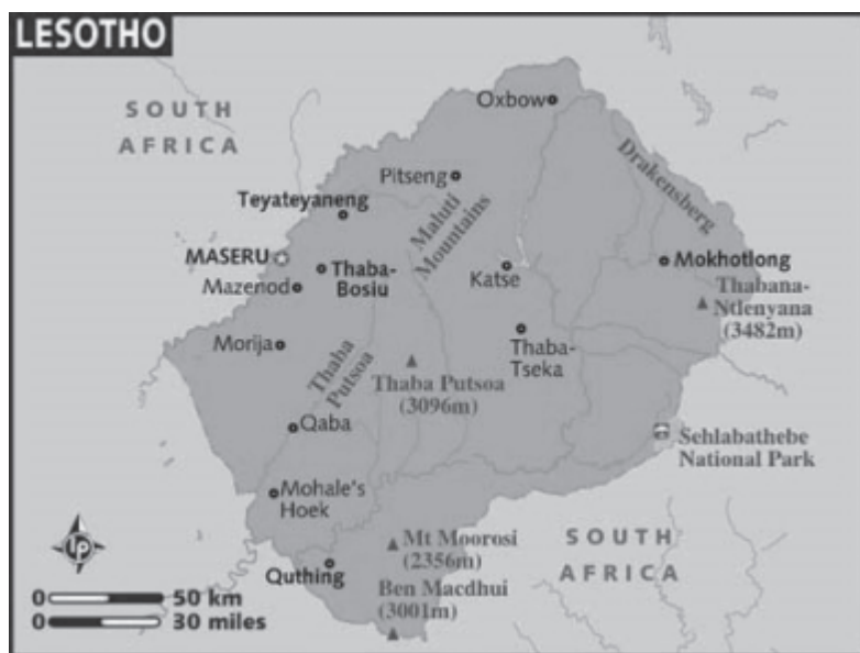
Figure 1. Map of Lesotho showing Mokhotlong in the east and Morija in the west.

missionaries and Basotho. PEMS played a leading political role in Lesotho until after 1920 when it left political matters largely in the hands of the local educated leadership which it had trained while the mission gradually “handed over all remaining areas of responsibility”, a process completed in 1964 just before the country’s independence (Gill 1993: 191). 1