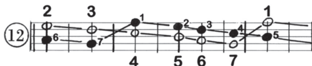
Figure 2. Luimbo lwa tshikona : the tshikona song. The encircled form number 12 indicates the tshikona song has a 12 pulse cycle. This is a transcription of the seven nanga reedpipe parts and of the time-keeper thungwa , one of the three drums played in performance of tshikona . Thungwa beats are shown by the heavier pulse lines. The average tempo of thungwa is 90MM. The large numbers and white notes show the starting pipe scale. The small numbers and black notes show the secondary pipe scale which is played on the same pipes and sounds simultaneously with the first. I have chosen to write Pipe 1 as a top line F in this ' Tshikona ' clef, using the note names of treble clef.