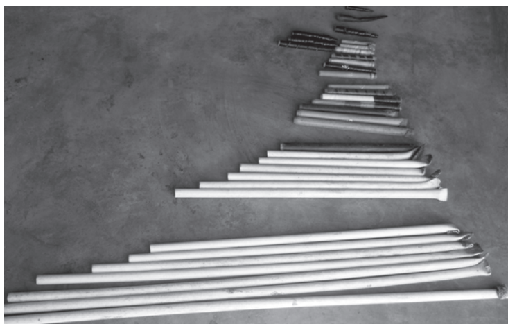
Figure 3. A mutavha (complete set) of nanga (pipes) of Khakhu Tondoni tshikona group, showing four octave groups of seven pipes each, and six high phalana pipes.