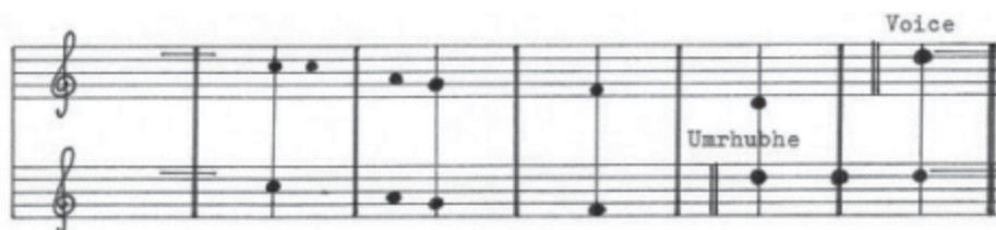
Figure 4. Substitution of weaker bow tones by higher, stronger tones in the umtshotsho (boys’ and girls’ dance) song Irobhane [CD track 4].