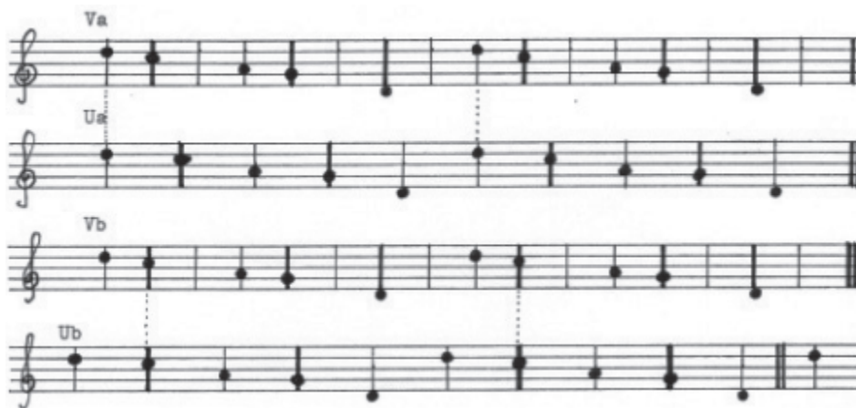
Figure 6. UTsiki : sung melody and Nongangekho Dywili's umrhubhe version of it.