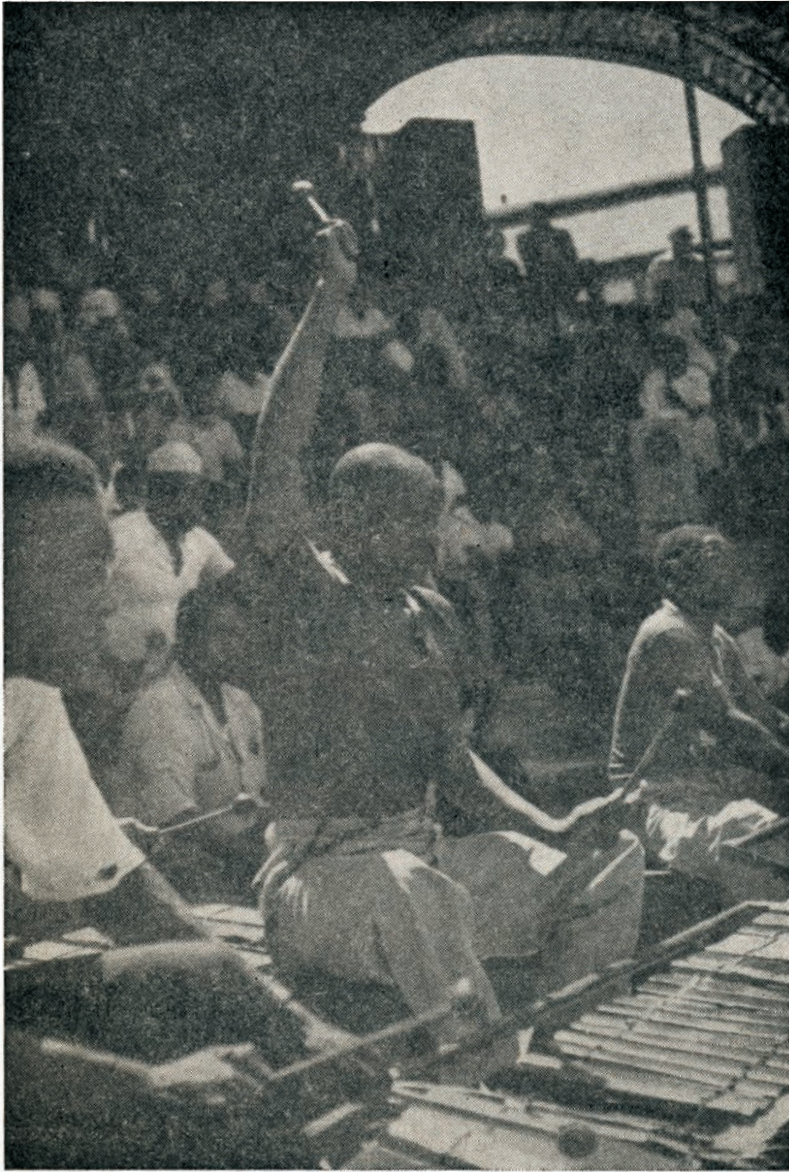
High-speed photograph of the leader of a Chopi timbila orchestra preparing to begin a new section of the music.