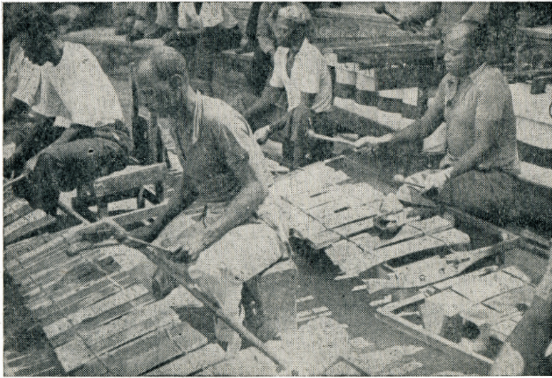
Two high-speed photographs of Chopi musicians playing in the arena of a Johannesburg Mine Compound. Note the looseness and turning of the wrists, especially of the bass players (top). If they were hitting their instruments they would not be holding the beaters in that way. The pictures also show how the wrists are suspended from the shoulders. In the second photo (bottom) the leader has just jerked his beret on to the xylophone of the man behind.